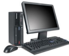
(ii) IBM ThinkCentre