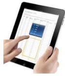
(i) Apple iPad